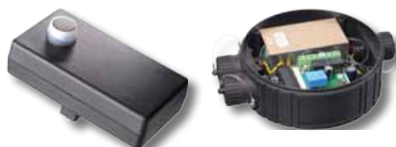
FLUX FRC 100