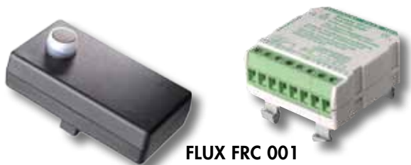
FLUX FRC 001

In order to guarantee the operating safety transmitter and receiver are addressed on each other.